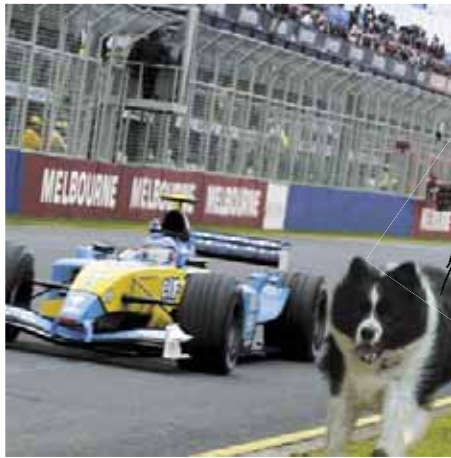
"Run Shadow Run"