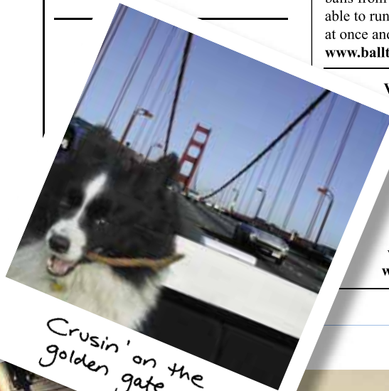
Crusin' on the golden gate...