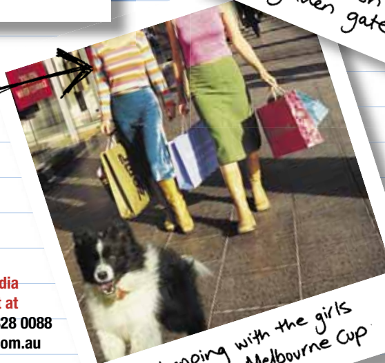
Shopping with the girls before the Melbourne Cup