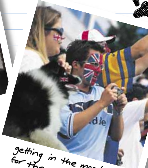
getting in the mood for the rugby world cup!