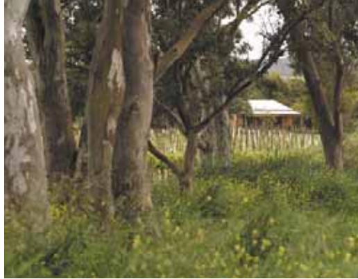
Everything I love about being home at Fox Creek - vineyards, wine and the old cellar door.

critics kept writing stuff like "children's masterpiece bought to life" and that really blew me away.