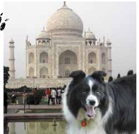
the biggest kennel I've ever seen!!